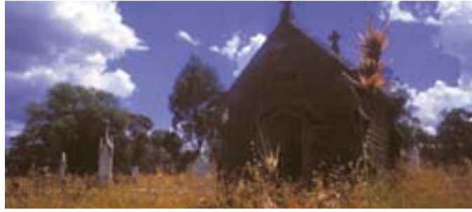
Axedale Catholic Cemetery

The Axedale Cemetery is situated at the end of the walking track, a short distance from the township of Axedale. The Catholic section is surrounded by a beautiful bluestone wall. This cemetery is a significant grassland site featuring Kangaroo Grass, Themeda triandra, and many other beautiful native wildflowers which flower in profusion in Spring and early Summer.