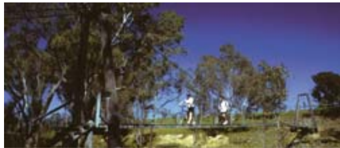
Axe Creek Swing Bridge