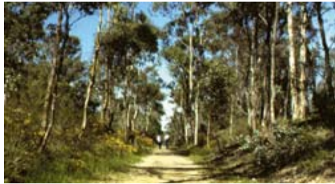
Yellow Gums lining the trail

Tread lightly and leave no trace of your visit.