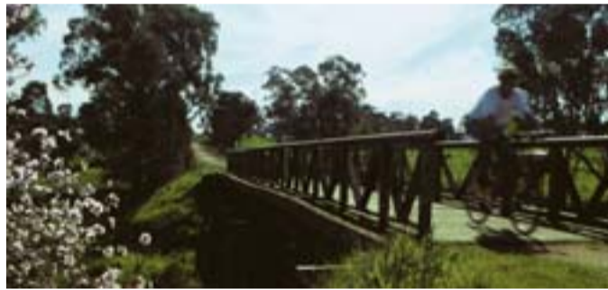
Original Rail Bridge, Strickland Rd

Now sites where car parking is available. At these sites and others, the motor rail would stop for passengers when that service was running.