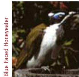
Blue Faced Honeyeater