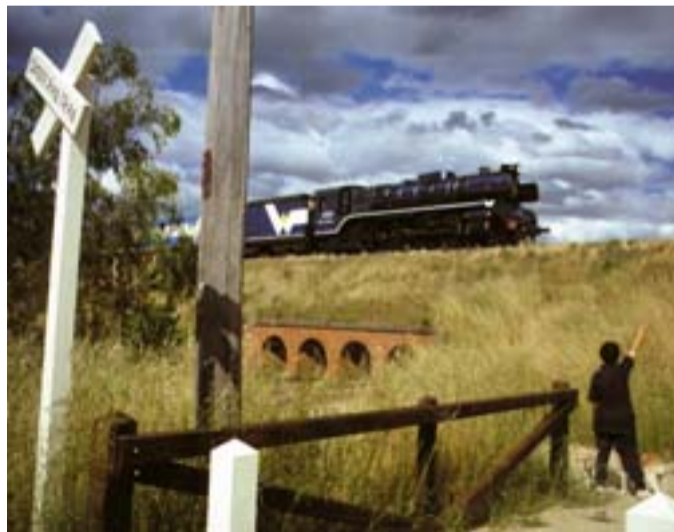
Train- 'Spirit of Bendigo' between Bob St & Murphy