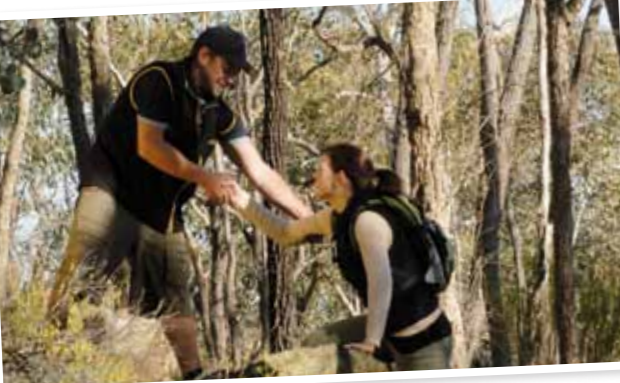
Besides all the exciting attractions on offer, Bendigo also has fantastic outdoor experiences for those families who enjoy the great outdoors!

Bendigo is known as a "City within a Forest", being completely surrounded by National and Regional Parks.